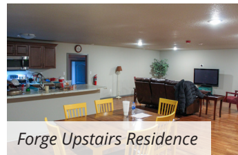
Forge Upstairs Residence