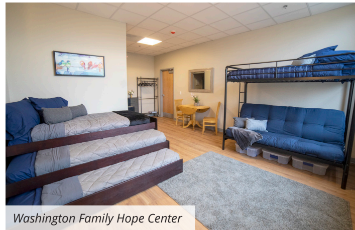
Washington Family Hope Center

If you haven't taken a tour of our new campuses, schedule one soon. Come see first hand how God is doing immeasurably more than we could have asked or imagined to bring redemption, relationship, hope and human dignity to the lives of our struggling neighbors.